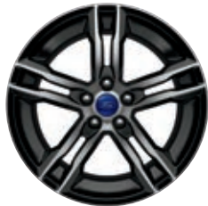
18" Premium Rado Gray-Painted Aluminum Standard